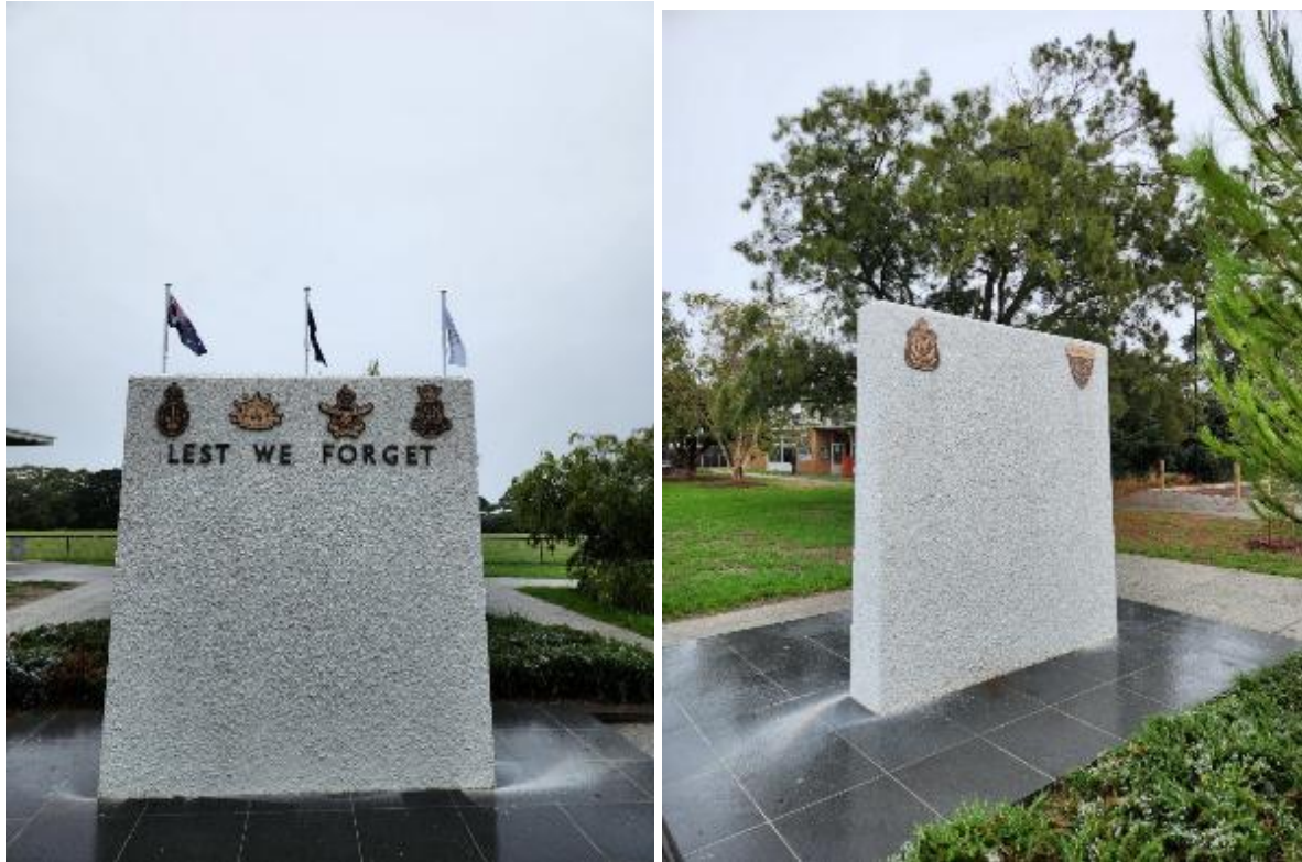
Flags flying and new plaques on our Cenotaph