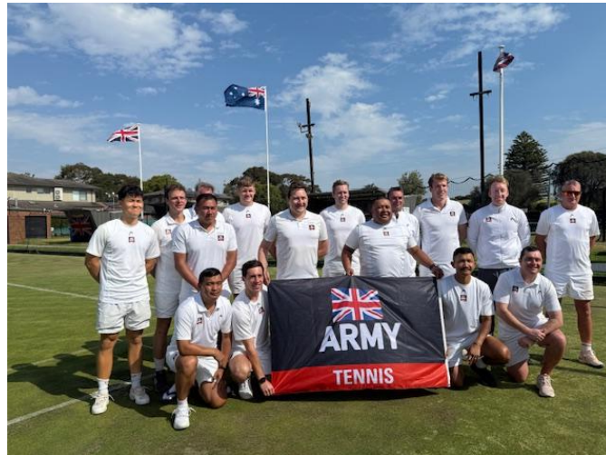
British Army Tennis squad 12 th January 2026 Beaumaris Sub-Branch