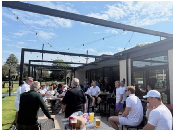
The deck was the place to be.

After a flurry of calls in early December & January from far and wide including BRSC we finally got to host the British Army Tennis squad. Everyone in attendance had a lovely day and enjoyed both the tennis and classic Aussie BBQ on the deck. We hope to do more of this sort of thing in the future.