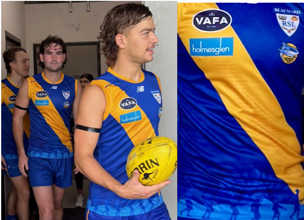
Players wearing the commemorative strip for the first time 26 th April 2025 Beaumaris Football Club

Our Sub-Branch has participated in an ANZAC football game with the Beaumaris Sharks for 8 years which has included an on-field commemoration and lunch with a variety of guest speakers from the Australian Defence Force.