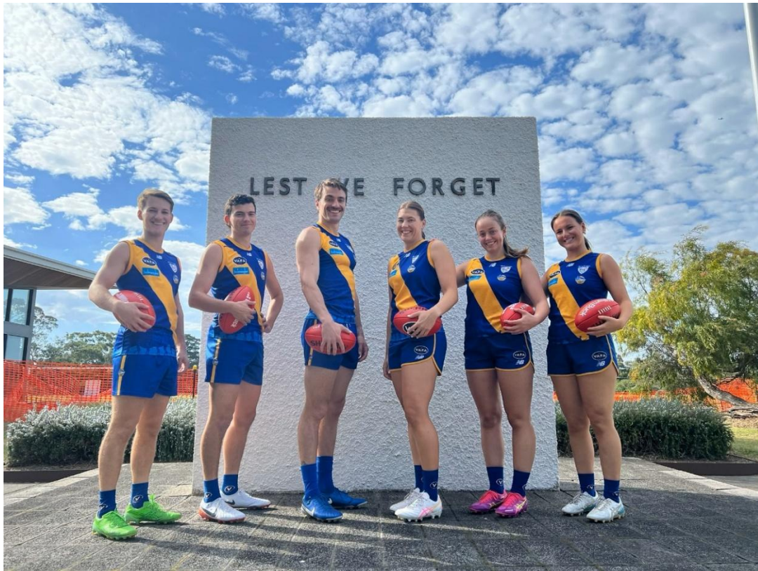
Beaumaris Sharks players wearing the inaugural Beaumaris Sub-Branch ANZAC commemorative strip