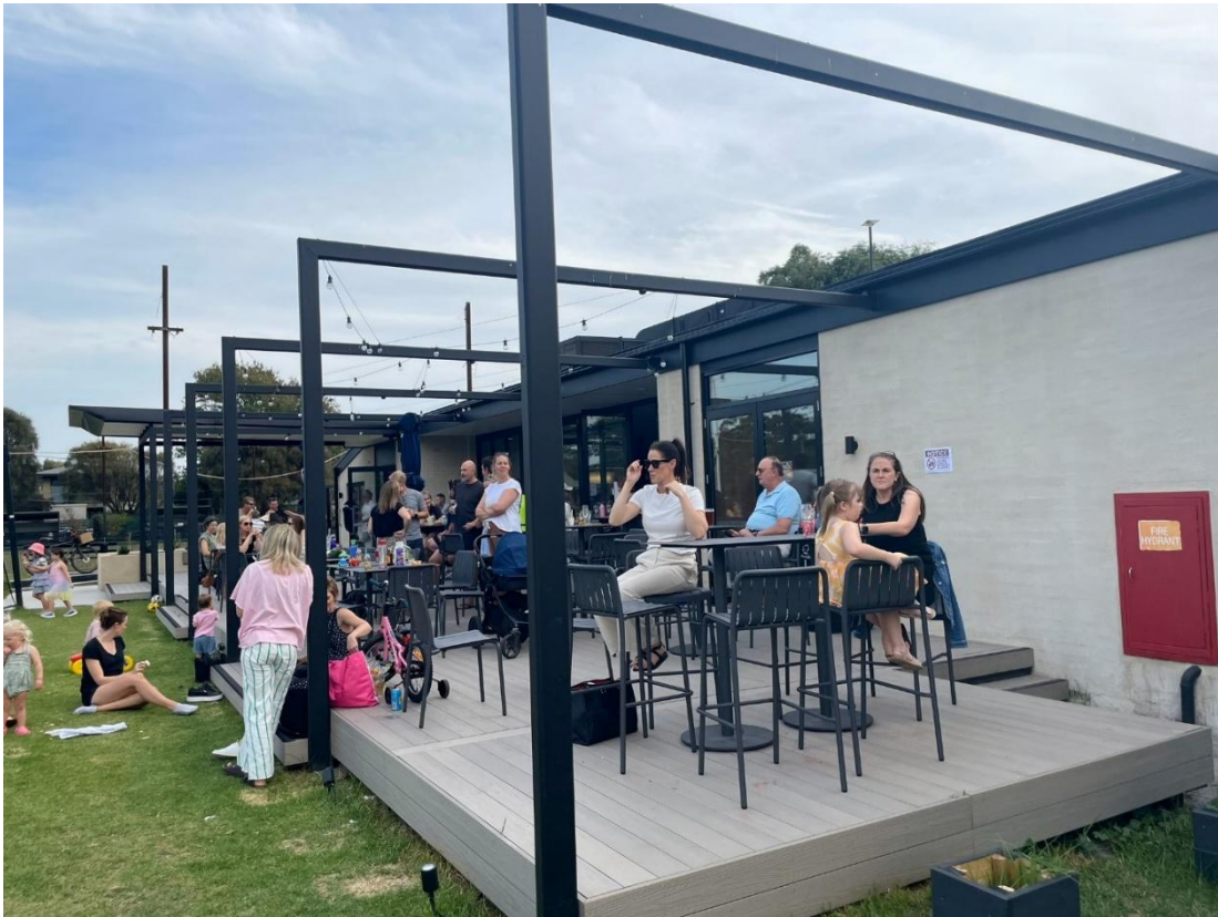
Families enjoying the new deck Friday 28 th of March 2025

With such lovely weather it was terrific to see the new deck being used by so many families. Our joint venture with the BRSC is only in its infancy and we have lots and lots of ideas to connect with our younger members of the community. As part of our presentations to State Branch regarding our proposed partnership these sort of occasions were highlight.