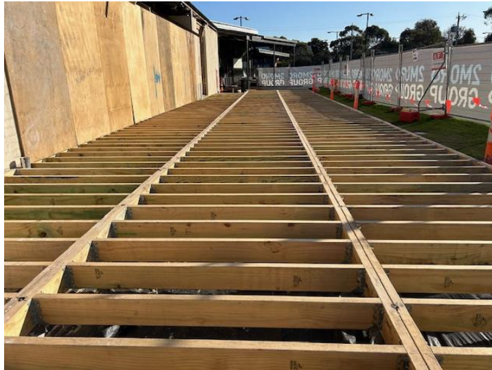
The new deck progress 19 Sep 2024.