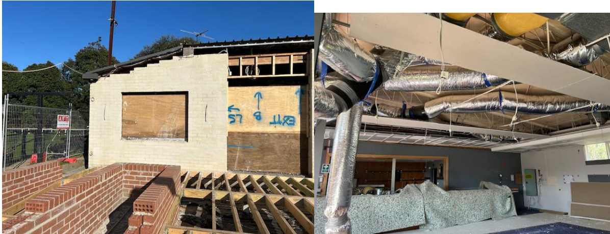
New bricked entry ramp and rendering of existing building. New groovy ceiling taking shape Sep 2024

The project is moving ahead a quite apace. Works inside and out continue to transform the old building and are on track. The Sub-Branch continues to keep the Victorian State Trustees informed of progress with a face to face/zoom meeting held on the 16 th of September.