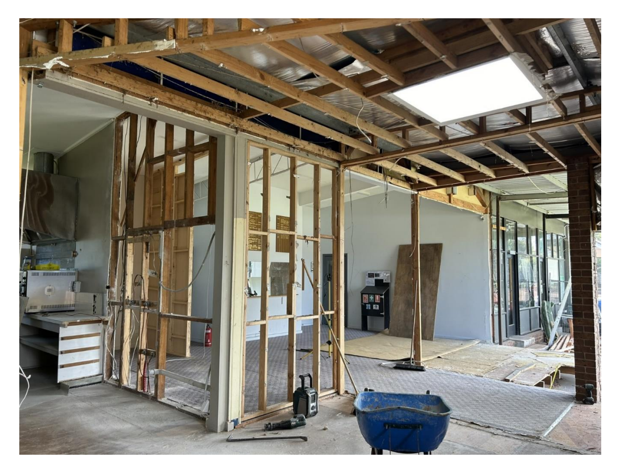
Stud walls of new RSL Remembrance Lounge July 2024

After nearly 2 years our refurbishment project has begun. Working Parties were arranged and the limited items of our extensive collection that were on display, were moved back into our warehouse for safe keeping during all the building activity that is now well underway.