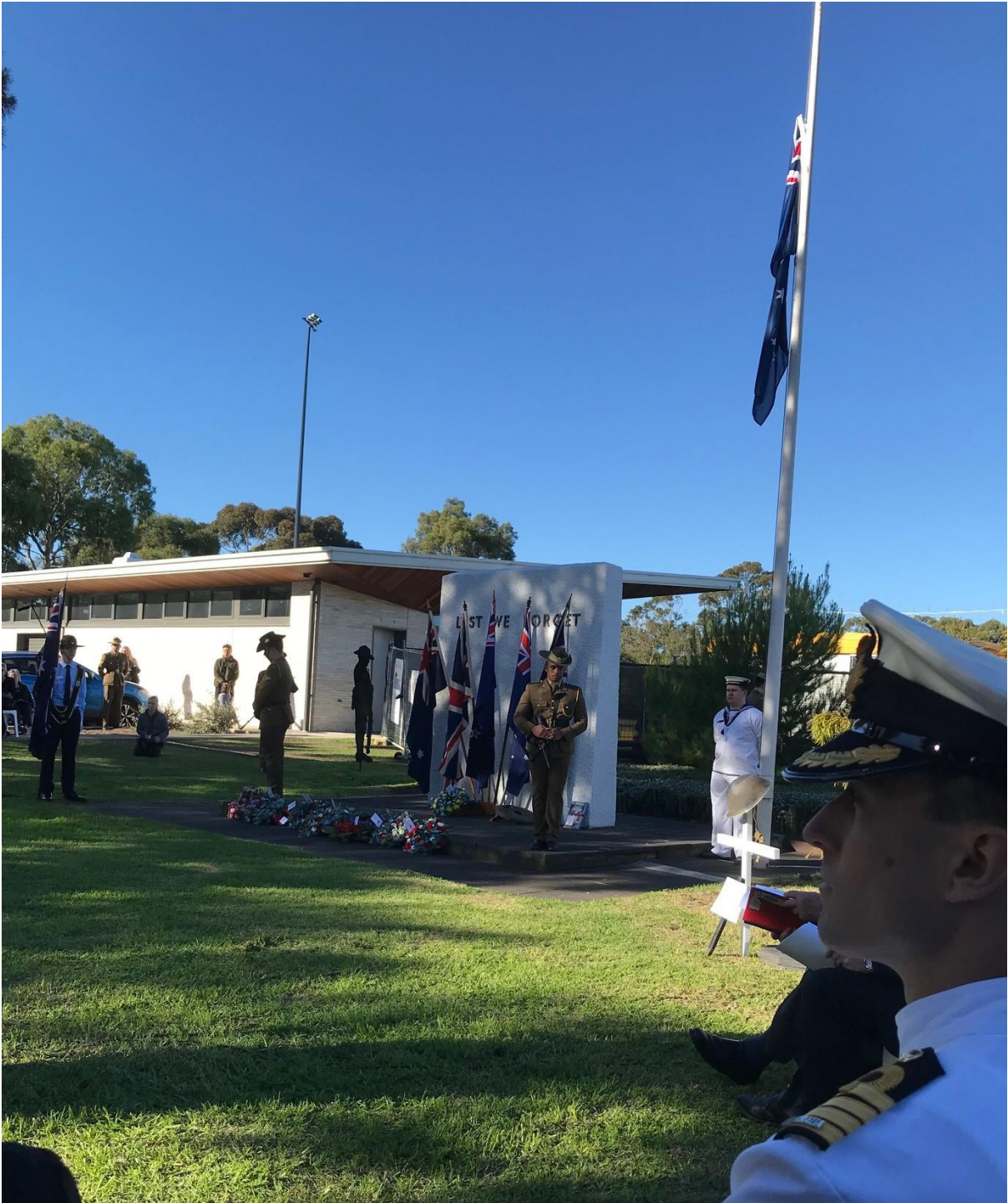
The Catafalque Party Mounted at the Cenotaph.