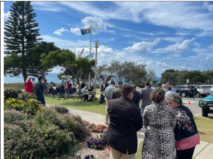
Australian National Flag along with White Ensign and RAAF Flag fly high at Rainbow Beach

Many members would recall the annual dinners to commemorate the battle which occurred on 18 th of August 1966. The Viet Cong launched in the early hours a surprise attack on the Australian newly established base at Nui Dat in the province of Phuoc Tuy which Australia had operational authority. A very good read can be found on the Australian Army website. https://www.army.gov.au/our-heritage/history/history-focus/battle-long-tan