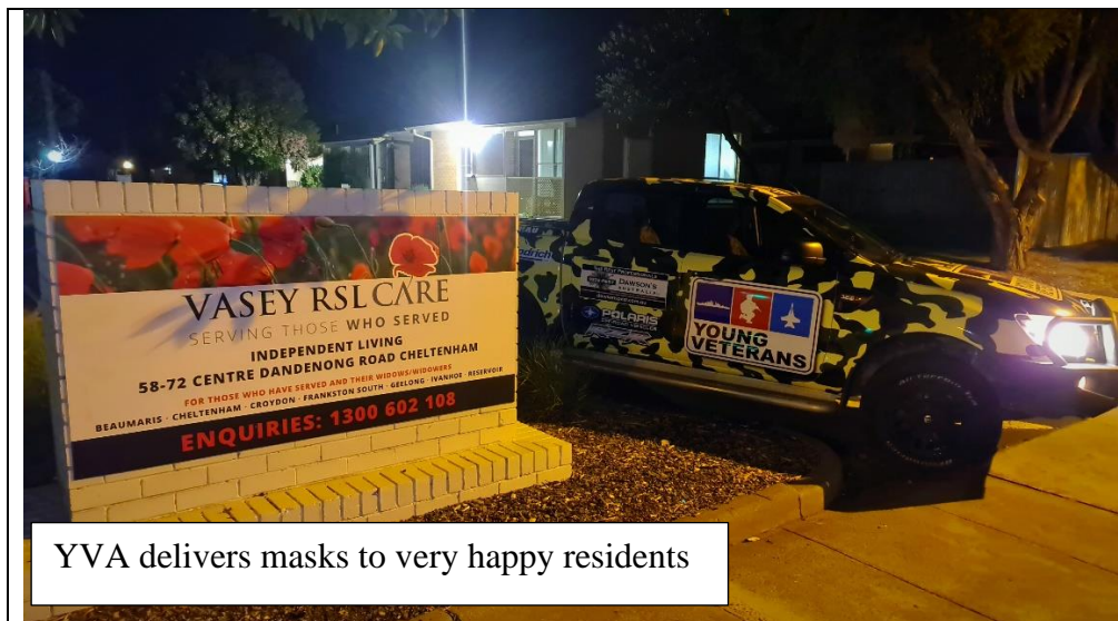
YVA delivers masks to very happy residents

Over the past 12 months the committee has been exploring options to support younger veterans directly as part of our mission to provide welfare to veterans. The Melbourne property market makes it unlikely for younger veterans to move into Beaumaris and that is why the committee has established a new relationship with YVA.