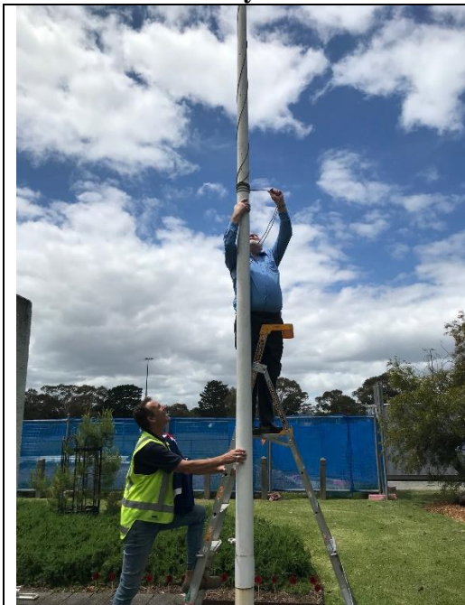
The Vice President goes aloft