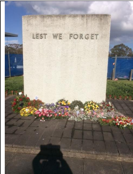
Wreaths laid by local community and members..