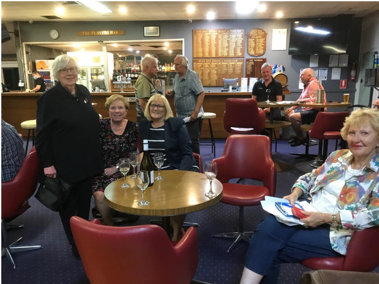
Beaumaris RSL Sub-Branch meets for a 'Stand To' every Wednesday from 5pm (Ode at 6.30pm)

We are very keen to have a large turn out to thank our organisers of the Long Tan dinner and meet members of the State Branch Executive. There will be platters of hot tasty snacks, drinks served by our lovely bar staff and of course lots of members to catch up with. We hope to see you there and don't forget the doors open early and the Ode is at 6.30pm. It would be terrific if you could bring a guest or two.