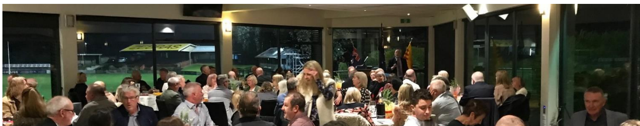
Beaumaris RSL Sub Branch Long Tan Dinner 18 th of August 2022