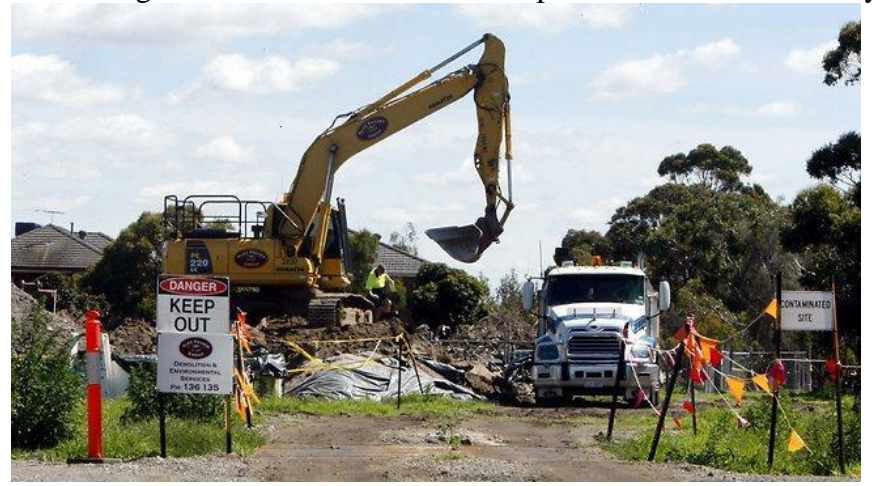
Merindah Park clean up 2013

His efforts with many others in the community over years campaigning to clean up the Dunlop lead acid battery manufacturing plant site in George St, Sandringham demonstrates his conviction to social justice. His subsequent volunteering contributions to the established Nature Reserve adjoining the site with the Friends Group through working bees, attending meetings and advocating for resources is another example of his local community work.